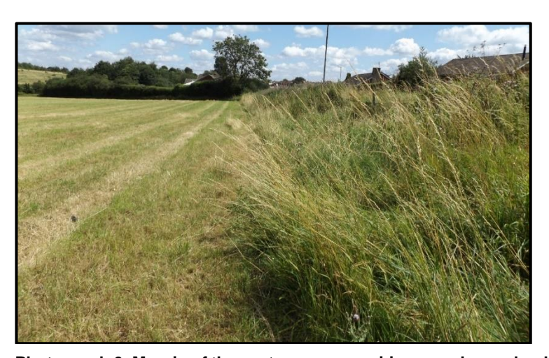
Photograph 6: Margin of the eastern poor semi-improved grassland field which remained unmanaged.