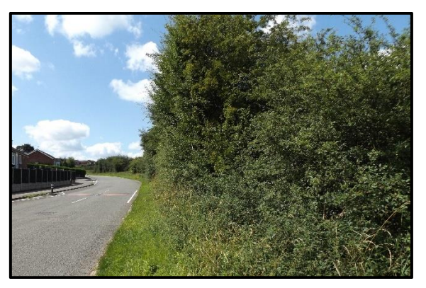
Photograph 7: Eastern strip of dense scrub along the southern site boundary – hedgerow that has grown out, managed for road visibility on the side facing Ashland Road only.