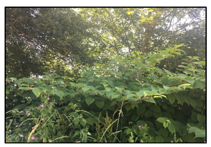
Photograph 18: Stands of Japanese knotweed within dense scrub of western site boundary, at c.10m in height and growing across a linear distance of c.6m along the boundary.