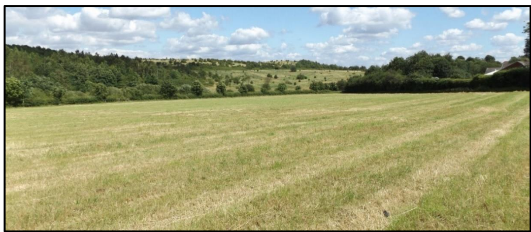
Photograph 5: Eastern field consisting of poor semi-improved grassland that had undergone recent management by being mown to approx. 10cm in sward height.