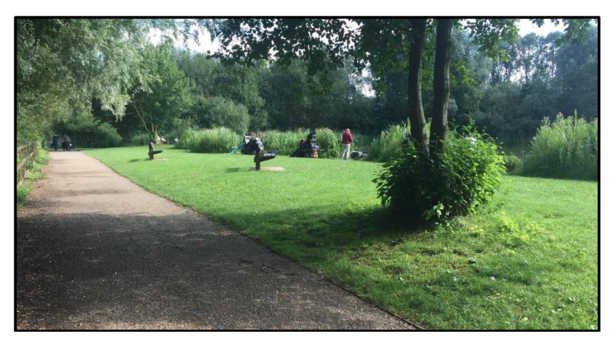
Photograph 16: Pond P1 Brierley Waters fishing pond; stocked with good fish population to allow daily angling opportunities; moderate terrestrial habitat in surroundings.