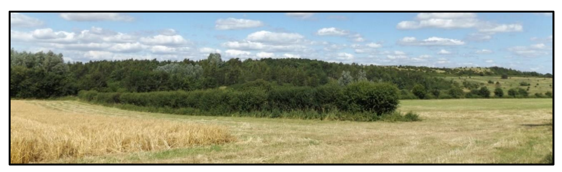
Photograph 14: Hedgerow H3 - between the eastern poor semi-improved grassland field, and the western wheat crop field with poor semi-improved grassland margins.