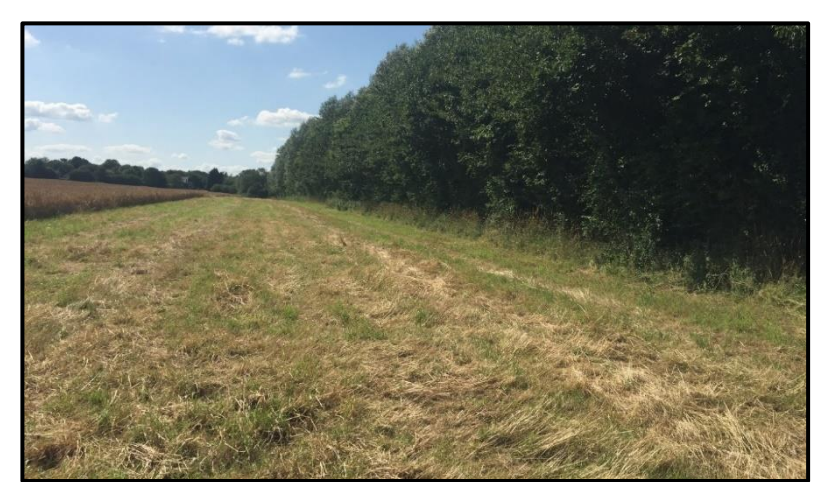
Photograph 2: Recently mown poor semi-improved grassland margins between the arable field and the northern site boundary, adjacent to dense scrub and woodland of Brierley Forest Park.

Photograph 1: Westerly view of the arable land (wheat crop), bound on all sides by a c. 10m wide, recently mown poor semi-improved grassland margin.