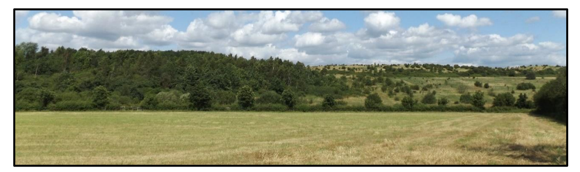
Photograph 12: Hedgerow H2 - on the boundary between Brierley Forest Park LNR/LWS (in the far distance) and the eastern poor semi-improved grassland field of the site. Stands of horse chestnut planted at regular intervals along its length.