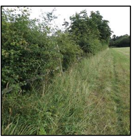
Photograph 11: Hedgerow H2 on the northern site boundary – Native species poor with trees, of moderate ecological value as scored under the HEGS, and a Habitat of Principal Importance