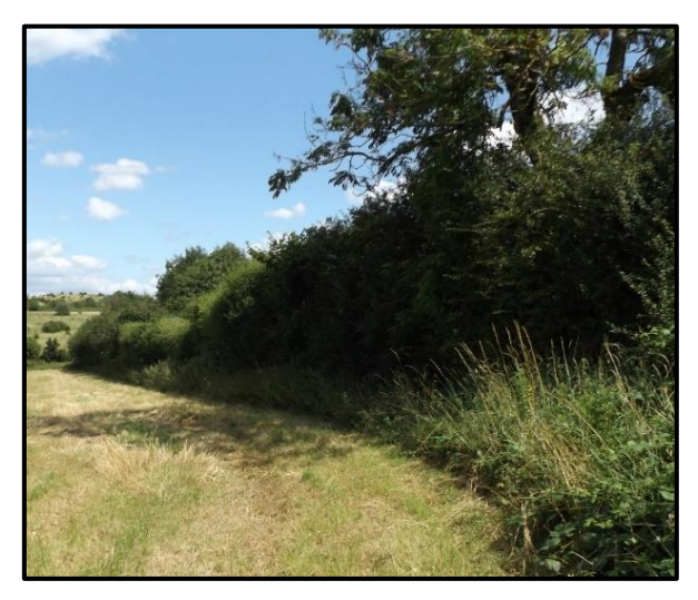
Photograph 10: Hedgerow H1 on the eastern site boundary – Native species poor with trees, of moderate ecological value as scored under the HEGS, and a Habitat of Principal Importance.