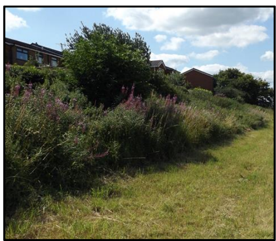
Photograph 4: Tall ruderal habitat progressing west along the southern boundary with increase in species and structural diversity.