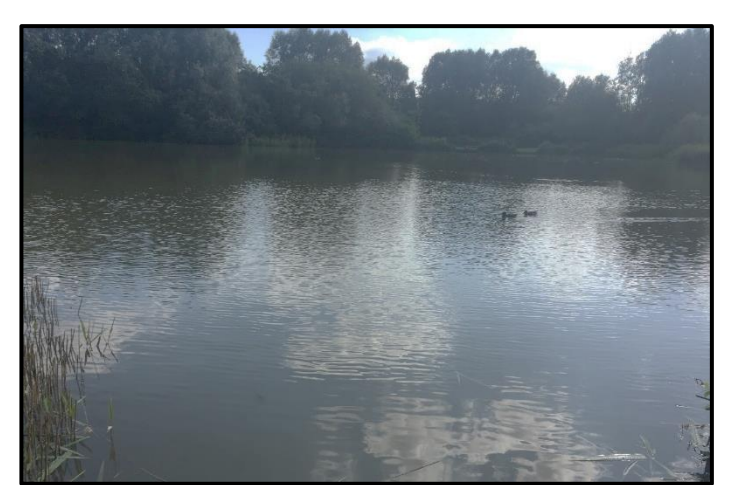
Photograph 15: Pond P1 Brierley Waters fishing pond; c.8350m<sup>2</sup>; never drying; good water quality; 20% shaded water surface; waterfowl present but little sign of impacts; very limited aquatic vegetation.