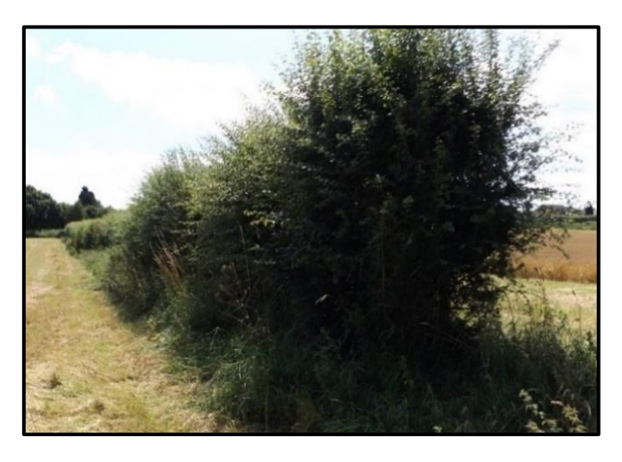
Photograph 13: Hedgerow H3 splitting the site in two – Native species poor, of moderate ecological value as scored under the HEGS, and a Habitat of Principal Importance.