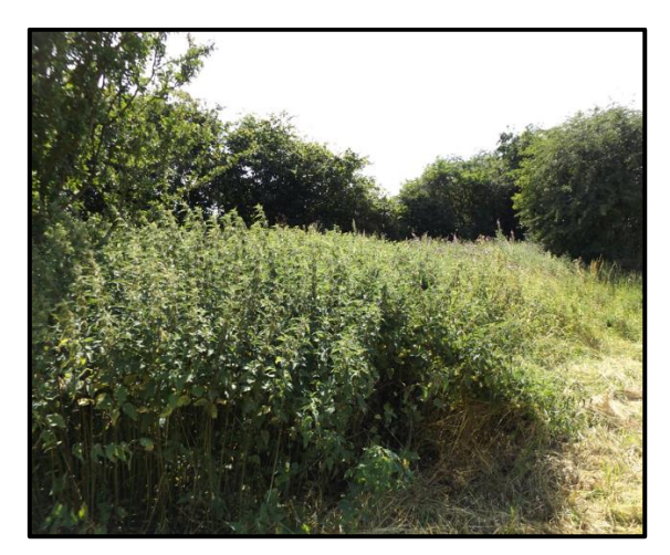
Photograph 3: Tall ruderal habitat on the eastern side of the southern boundary.