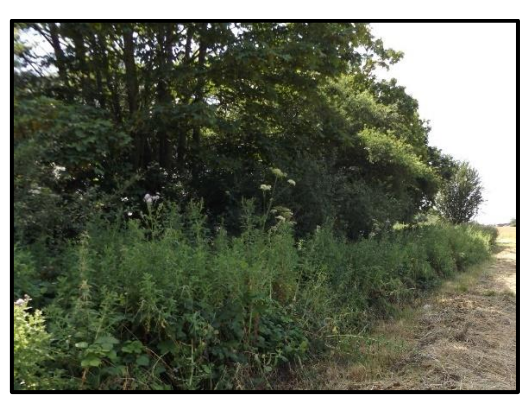
Photograph 8: Eastern strip of dense scrub with trees along the southern site boundary